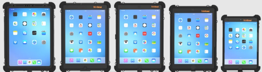
iPad Pro 11