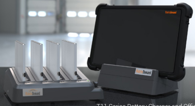
T11 Series Battery Charger and Office Dock