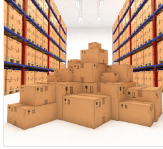
RERACKING AND SLOTTING